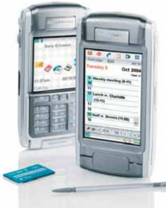
Sony Ericsson P910i

formats (Word, PDF, etc.). It also has very high quality MP3 playback. With a 1 GB memory stick due, it gives the ARM7-based iPod a run for its money.