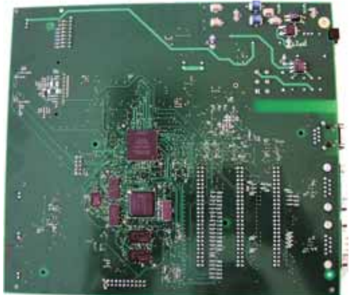
Snapper integrated onto a single PCB

To make the single PCB for the product in question, the original connector board design was used as a base and the Snapper socket replaced with the actual Snapper design. Some components that were not required were removed and we selected the 200 MHz variant of Snapper's Intel XScale processor as the standard 400MHz version was not required.